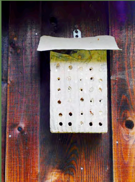
Native bee nesting box