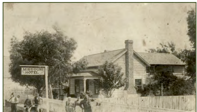
Missouri Hotel Early 1900's