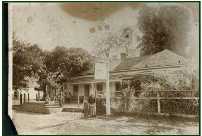
Missouri Hotel Approximately 1907 Note the stage steps for wagons in front of the hotel